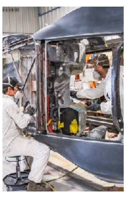
Body & Paint Technician